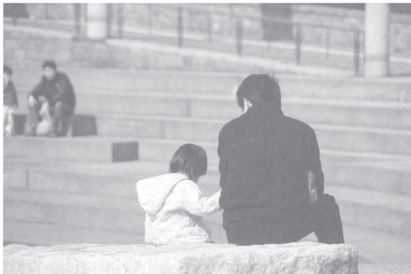
father / talk