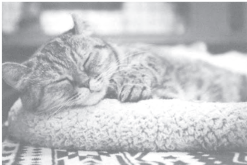
blanket / sleep